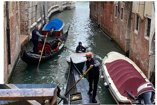
Venice (above and left)

You should be in good health and relatively fit, as both Verona and other Italian cities are 'walking' cities. By 'fit', we simply mean that we do walk around, and we walk a fair bit. It is possible to take taxis, but walking and bus are the norm for the locals, as it generally is for us.