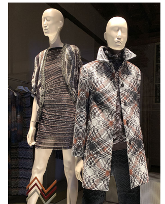
Fashion Windows seen on our Fashion Walk