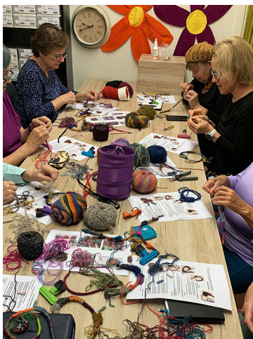
Textile Art Workshop