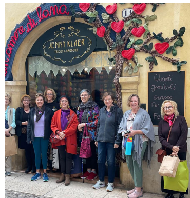
Knit Store, Verona