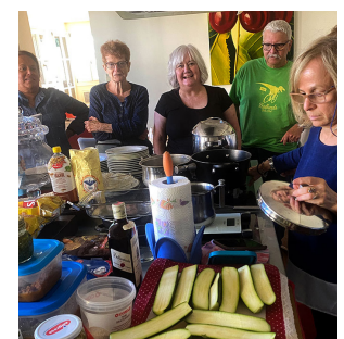
Cooking class with Nonna and family