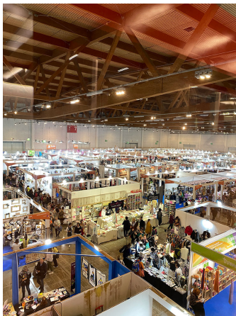
Abilmente Craft Show

design, sustainability, idea shopping, and more. In addition, we will have fashion appointments that include visits to artisans, fabric and yarn stores, designers, and a knitting mill. There will be two out-of-town trips. As always, we will also take a trip to Venice to explore its sights and activities related to fashion. We will also attend an event called Abilmente (the Salon of Creative Ideas) which is in Vicenza and features exhibits, workshops, and vendors. We are leaving the last Saturday free for you to choose what you want to do, whether it be shopping or visiting yet another city outside of Verona.