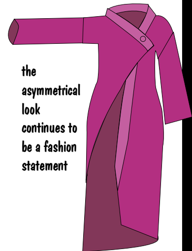
the asymmetrical look continues to be a fashion statement

Asymmetric – There is a certain rhythm to the unbalanced look of an asymmetrical garment. Expect to see differing garment lengths (left to right), angled lines, asymmetrical closures and more. Garment Designer makes this type of design easy to create, so have fun!